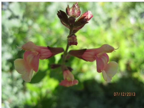
Salvia greggii 'Peaches and cream' at Pat's place

beautiful sage. I saw salvia columbariae , carduacea , cyanescens , ionocalyx , ringens , interrupta to name a few in flower. It was great seeing them in flower, as the closest I have ever come to seeing the flowers was via google.